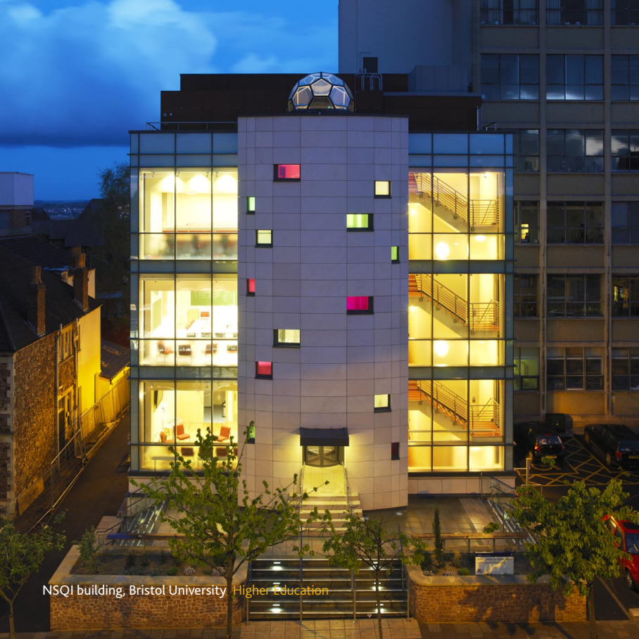
NSQI building, Bristol University Higher Education