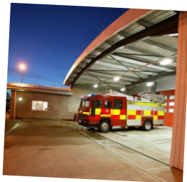
Fire and rescue