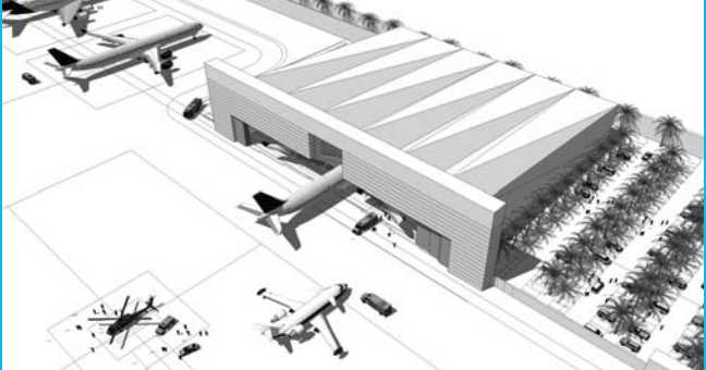
Development of VIP facilities in the Middle East

Management consultancy Aviation policy advice Business strategy Capital investment review Due diligence Environmental policy Feasibility planning Security